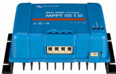
Solar Charge Controller MPPT 100/30